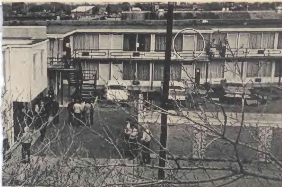
The sniper's view of the Lorraine Motel in Memphis. A detective examines the gun used to kill Martin Luther King.